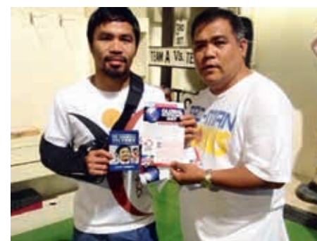
Manny Pacquiao with G.O.D. Tract

Christians were trained in evangelism, and 12,245 people made decisions for Jesus. In one of the largest slum neighborhoods in Manila, many were reached with the Gospel. A lame woman was prayed for, after which she could walk again.