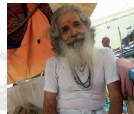
An Indian Guru

A Guru from the highest caste was very open to the message and gave his life to Jesus directly by the Ganges River after he was prayed for.