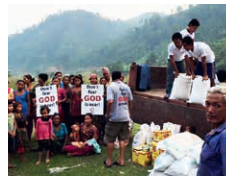
In the Mountains of Nepal

country was a testimony of fruition, unity, and an active and prepared Body of Christ which adopted Global Outreach Day as its own vision.