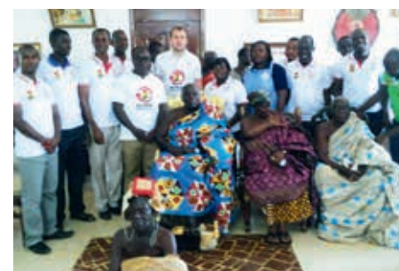
The King of Ghana

Almost 800,000 Christians were actively involved and reached more than two million souls all across Ghana with the Gospel. 741,150 people made a decision for Christ.