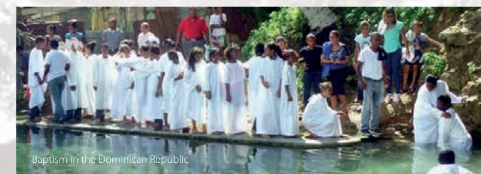
Baptism in the Dominican Republic

She accepted Jesus, was baptized and died shortly thereafter. That was her last chance to make sure she spent eternity with God. One team went to a hospital. The leader was a doctor himself. He reported that three people were healed of Aids.